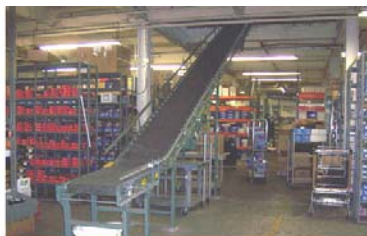
A conveyor is needed to bring product down from an upper portion of the warehouse!

tell your poja SalesPro about your inventory issues.