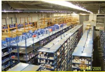
10,000 sq feet of a total of 53,000 square feet of floor space. This area has a small mezzanine already and can double it's capacity

The poja Warehouse is located in Philadelphia, Pa. The 24 member locations are supplied by this warehouse. Product lines are being added each month. The poja Warehouse is owned and operated by the members. Buying power of one large location is passed on to all 24 member stores. This increased buying power allows for poja Profit Pricing. www.poja.org